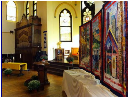
Pictures from the ordination and celebration of the call to Elaine Connolly September 26, 2010