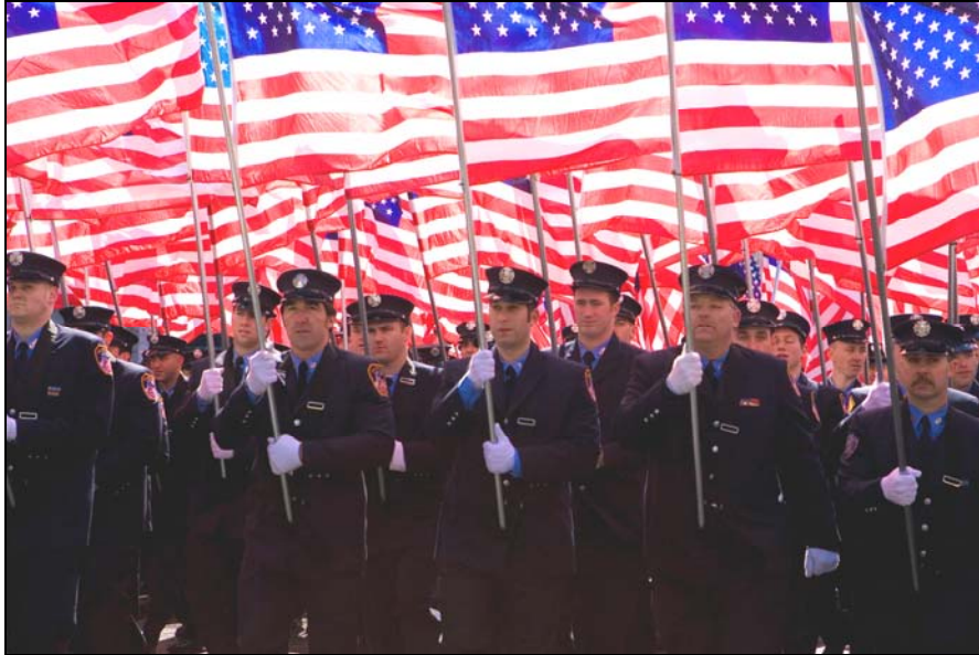
St. Patrick's Day Parade '07; Honoring 343 Fallen Firefighter in 9.11