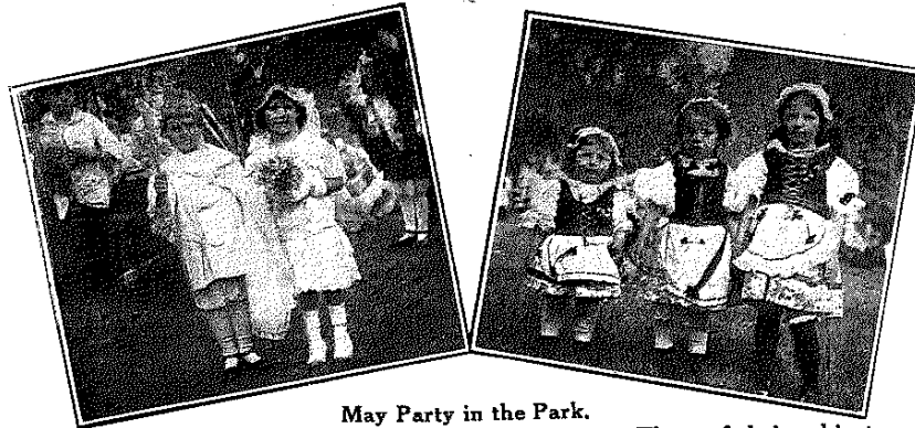
The King and Queen.