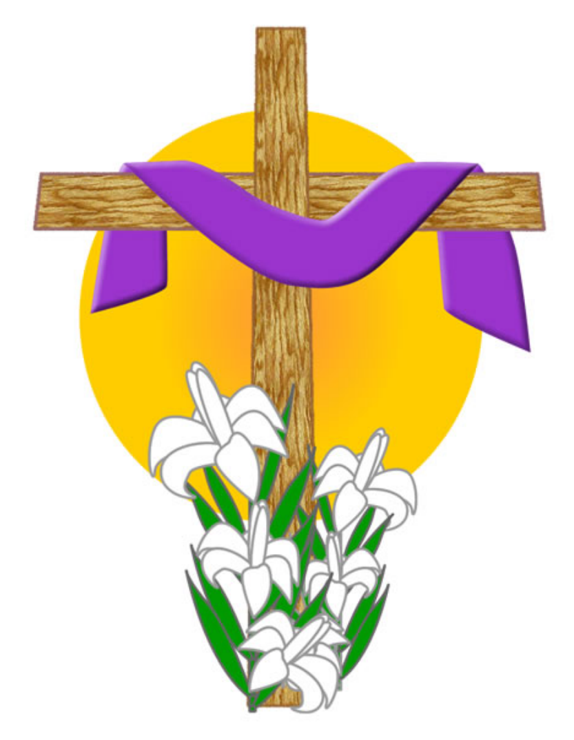
He is Risen, Indeed!